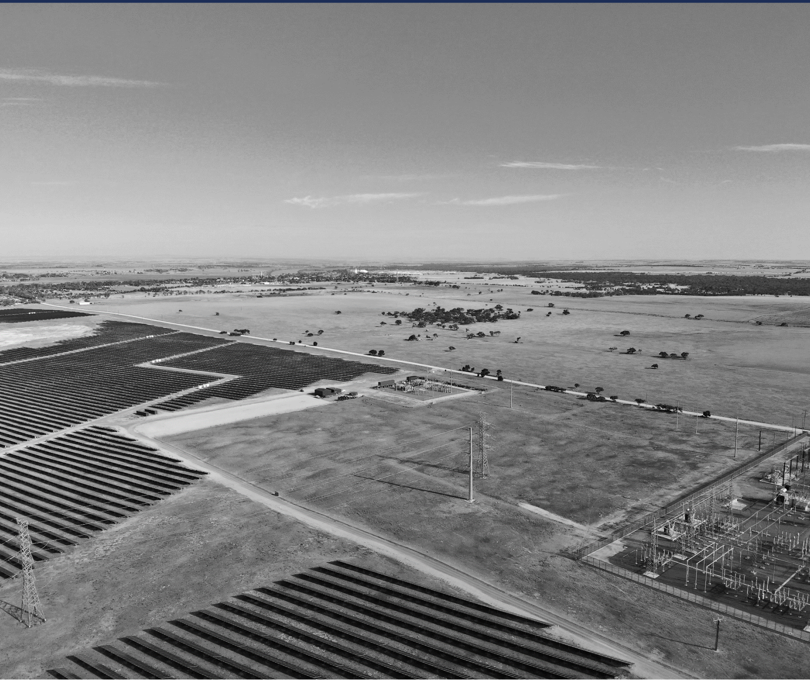
Figure 1: Tailem Bend Solar Project and pre-construction status of Tailem Bend 2 Solar Farm.

Community Sponsorship Program November 2023 Version 6